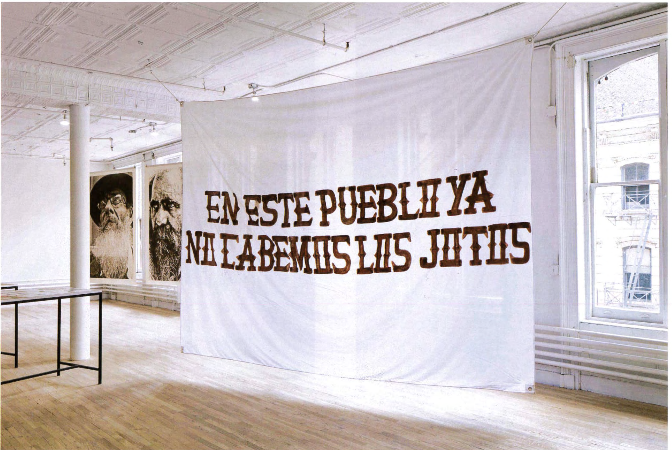
1 & 2 courtesy: Artists Space, New York