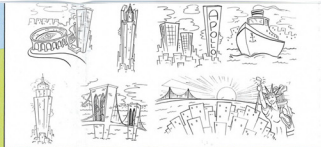
TOM BOBROWIECKI New York Views

Wall drawings representing various New York landmarks and neighborhoods created especially for the exhibition.