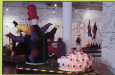
13 (Par 3) PAT OLESZKO & WARD SHELLY CENSORAMA

Take a swing. Try to hit the black hole in the galaxy.