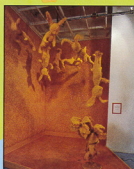
3 (Par 2) MEL CHIN

شلال Shelter في المصعد العنبر ببناء أروع نحن ننحسبنا In the Gracie: The Year begins with the Lives we end.