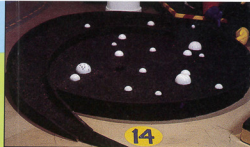
10 (Par 4) JOHN TORREALANO Black Hole Anonymously Sponsored

Take a swing. Try to hit the black hole in the galaxy.