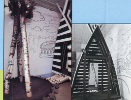
10 (Par 3) JOHN DIEBOLL The Purgatorium and the Corcan of Hedon

It's Judgement Day and the Cup has ascended in the Garden. It's just a small hole in the Sky. How many Putts have we committed? How many more will we commit before our balls rise into the Cup above the black and white Tree?