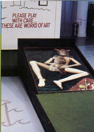
13 (Par 3) CINDY SHERMAN Unfilled Sponsored by Linda & Ronald Datz

Because a miniature golf course is a landscape that is usually devoid of foliage, I have decided to design obstacles which are based on the most formal of gardens; the topiary garden. These images are cast of copper and aluminum with gravel borders. I have used this theme to both whimsically engage and frustrate the participant that embarks on this journey.