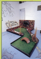
3 (Par 2) JOAN SNYDER To the Pond and the Painting