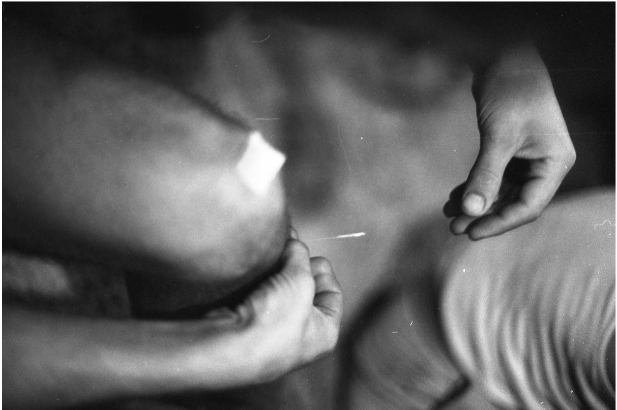
Yuji Agemastu, Acupuncture session with Milford Graves , c. 1990s.