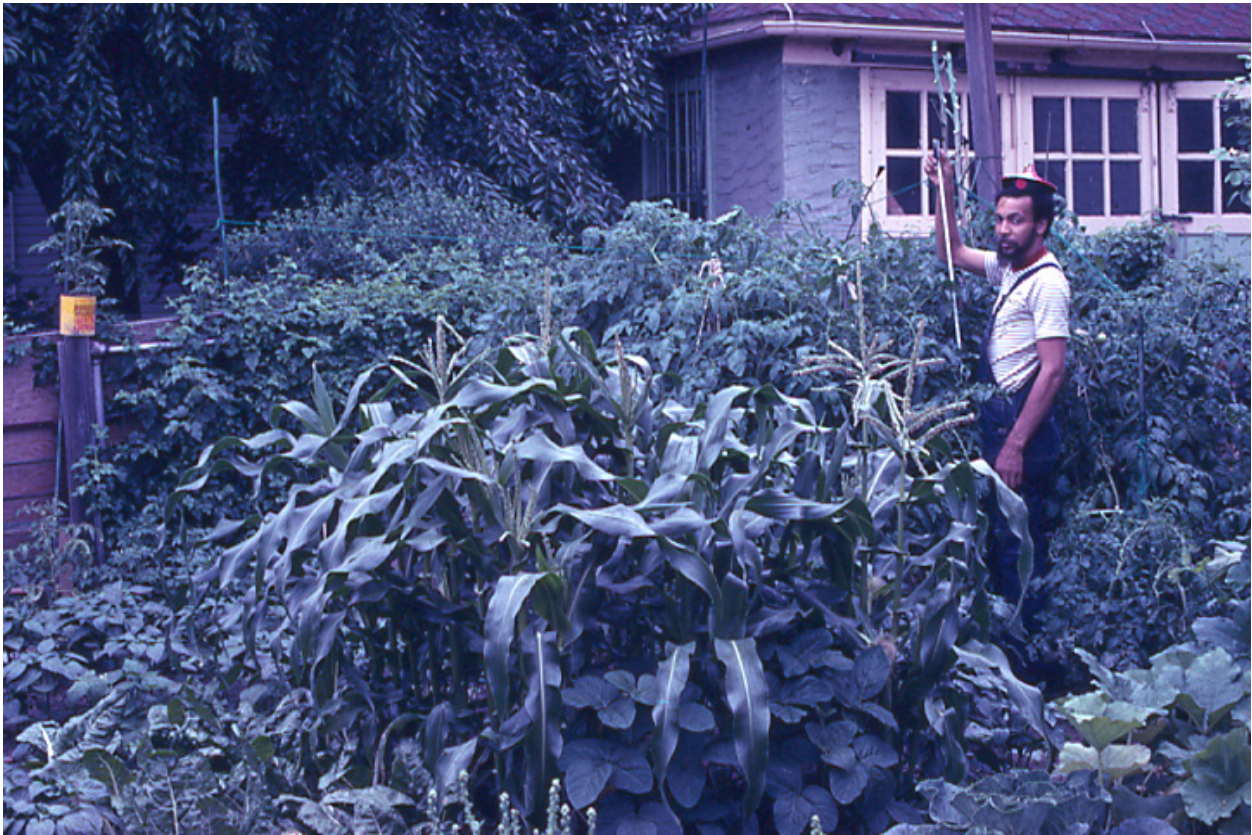
Portrait of Milford Graves in his garden, Jamaica, Queens, c. 1980s.