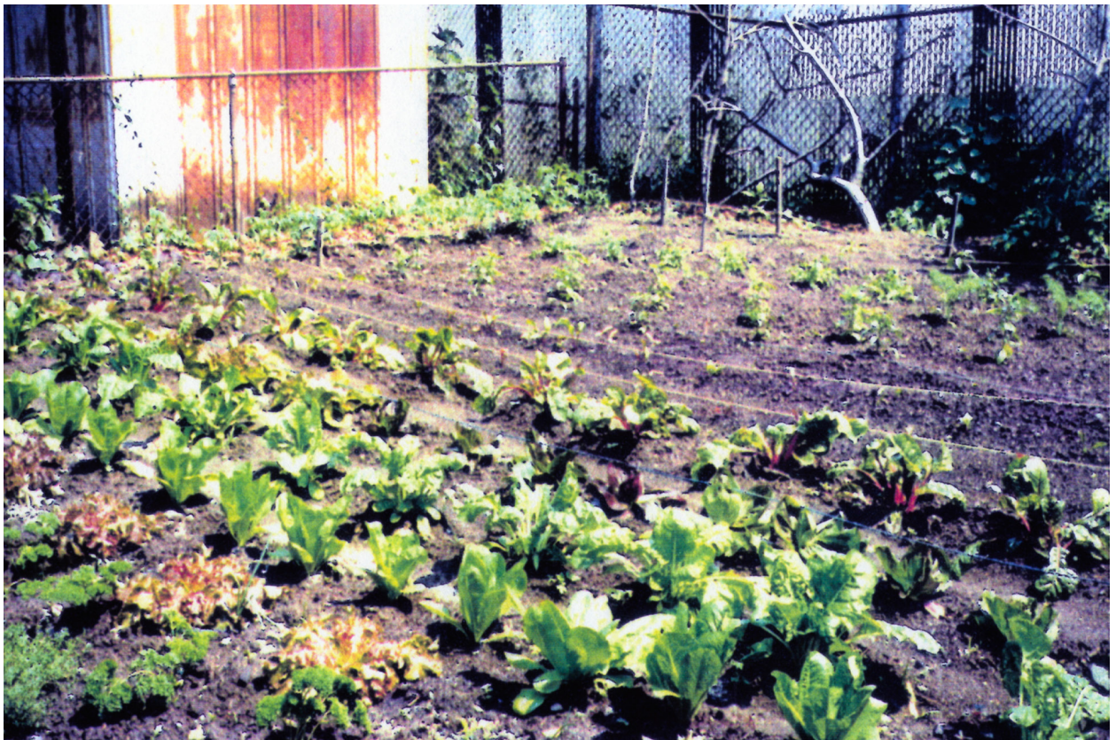
Milford Graves' garden, Jamaica, Queens , c. 1980s.