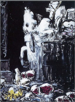
Trash 1990 mixed media Courtesy of the artist photo: courtesy of the artist