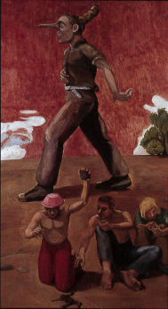
Untitled 1990 oil on canvas, 40 x 70 inches Courtesy of the artist