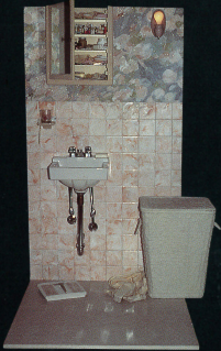
Pandora's Bath 1990 mixed media on wood, 71 x 46 x 41 1/2 inches Courtesy of the artist photo: courtesy of the artist