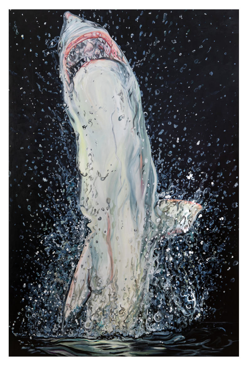
"GWF 2," 2019.