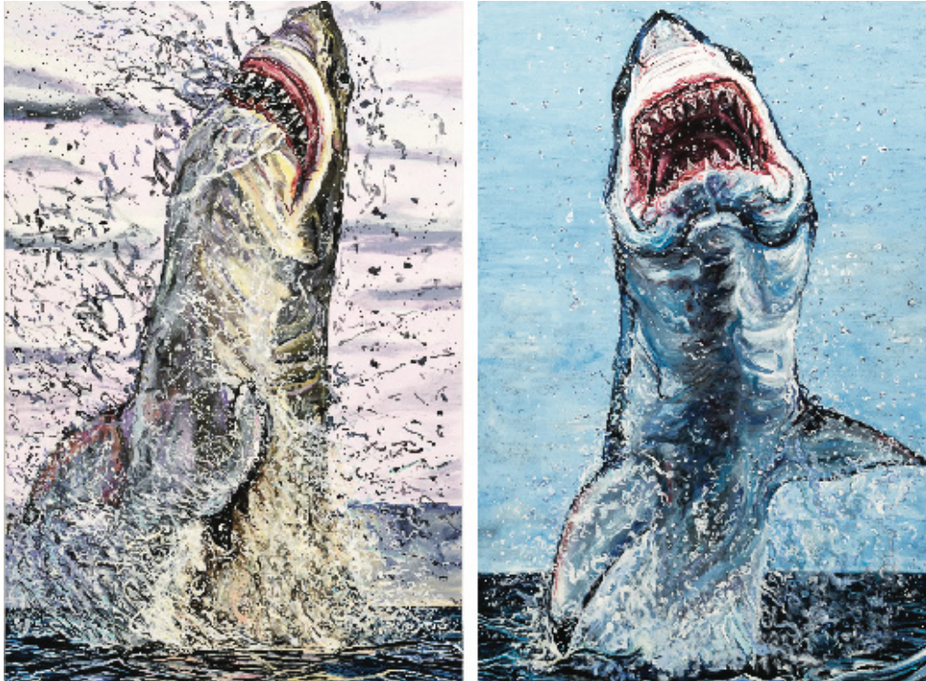
Left, GWF 5 , 2019, acrylic on canvas, 118 by 78 inches. Right, GWF 1 , 2019, oil on canvas, 118 by 78 inches

Often, she includes paintings or drawings that model the architecture of the space, featuring warped, airbrushed figures contorting their bodies to fit into its confines, a gesture that reached its apotheosis in Whitney (2013): exhibited in a small presentation with Stewart Uoo at the Whitney Museum of American Art in New York in 2013, the painting is a multilayered rebus linking the Breuer building, the museum's home at the time, to a portrait of Whitney Houston, with depictions of creatures that Euler calls "human snails" coiling around them. Elsewhere, she has incorporated the titles of her exhibitions into large textual friezes or anamorphic wall murals that distort the viewer's