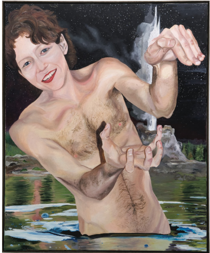
Ruth Suckale, 2009, oil on canvas, 44 by 36 inches.