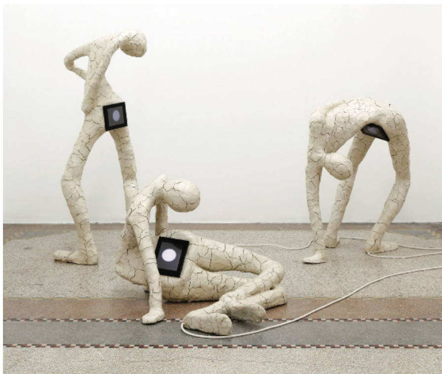
Form Follows Information Exchange 1, 2, and 3 , 2010, clay, video, and mixed mediums.

central voids. They are paired with shallow representations of plenitude that might fill them: religion, beauty regimens, consumption—the last bluntly embodied by an overflowing garbage bag. One titled „ „ (2016) tunnels through a woman’s face, the void where her nose should be offering an impossible view of her body, both back and front. Inverting the Surrealist trope of the body in pieces, Euler offers a form that is cohesive, but incoherent, a smooth and precise anatomical aberration. It finds its double in Filled (capitalism) , 2016, a lithe, crouching nude—face and fingernails painted, crotch shaved—futilely attempting to embrace her own phantasmic reflection.