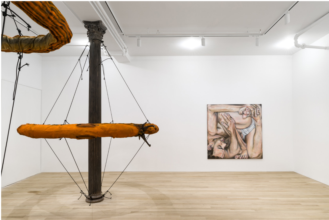
View of Euler's exhibition "Unform," showing (on wall) Close Rotation (Right) , 2019, acrylic on linen, 78 inches square.

Euler's slugs are not so much painted sculptures as paintings made sculptural. She painted the components flat on unstretched linen canvas and then assembled them in situ. If the wholes cohere into a painfully representational form, the individual elements are largely abstract: bloomy, stained fields of pigment on the creatures' undersides; striped and stippled patterns on their tops, rendered in the same translucent layers that characterize her two-dimensional canvases. The experience of walking around them is one of toggling back and forth between abstraction and figuration, image and object. They are at once unlike anything she's ever exhibited, and utterly emblematic in their mix of painterly intelligence and aesthetic unpleasantness: what could be less beautiful than a room crawling with giant gastropods in a palette of