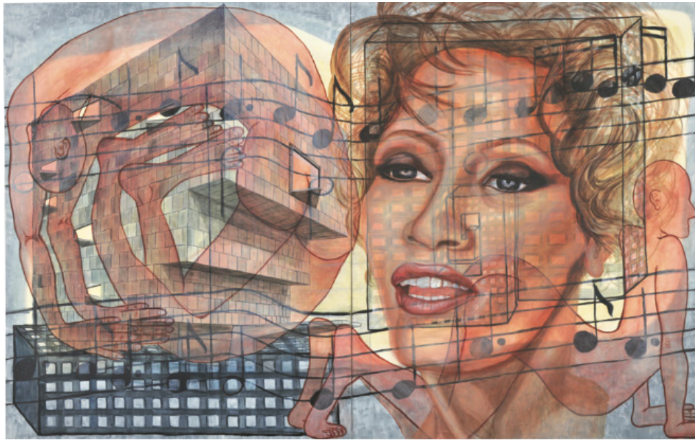
Whitney , 2013, oil on canvas, 74 by 118 inches.

central voids. They are paired with shallow representations of plenitude that might fill them: religion, beauty regimens, consumption—the last bluntly embodied by an overflowing garbage bag. One titled „ „ (2016) tunnels through a woman’s face, the void where her nose should be offering an impossible view of her body, both back and front. Inverting the Surrealist trope of the body in pieces, Euler offers a form that is cohesive, but incoherent, a smooth and precise anatomical aberration. It finds its double in Filled (capitalism) , 2016, a lithe, crouching nude—face and fingernails painted, crotch shaved—futilely attempting to embrace her own phantasmic reflection.