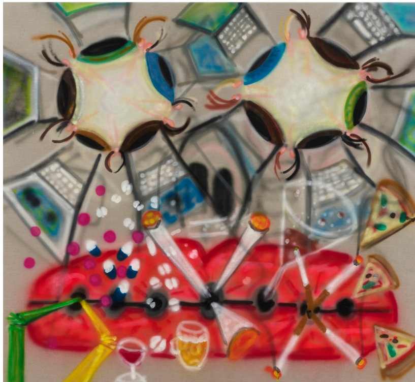
Under Distraction , 2019, oil on linen, 78 by 86 inches.