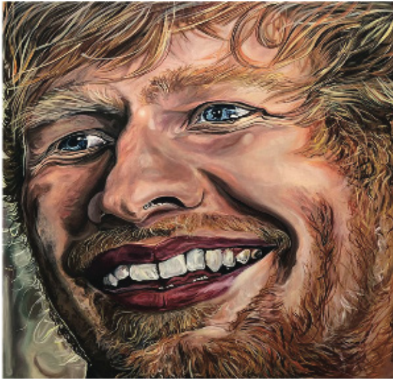
Shape of painting, summer hit 2017, 2018, oil on canvas, 78 3/4 inches square.