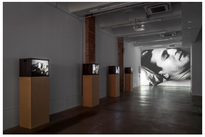
Left to Right: Installation View of Thanx 4 Nothing , 2011 by Ugo Rondinone at Sky Art, 2017. Photo by Daniel Pérez © Ugo Rondinone. Courtesy of Nadine Johnson; Installation View of Andy Warhol, Sleep, 1963 and other works by Andy Warhol, at Swiss Institute, 2017 Photo by Daniel Pérez. © The Andy Warhol Museum, Pittsburgh; Founding Collection, 2017 The Andy Warhol Foundation for the Visual Arts, Inc./ Artists Rights Society (ARS), New York.