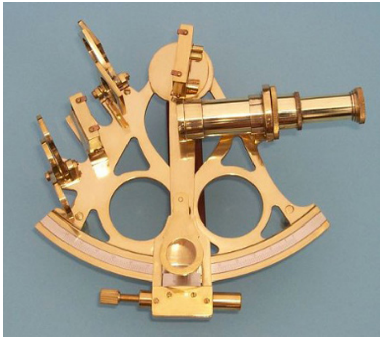
The sextant, a nautical instrument which determined the angle between a celestial object and the horizon.

The angle between the horizon and the Pole star gave information about the altitude of one's position. This measurement method was known as sighting the object, shooting the object, or taking a sight . In this way, one's own location could be at least roughly determined.