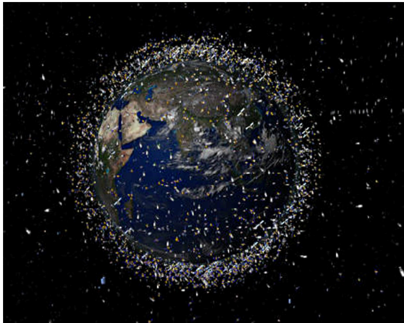
Space debris or junk (such as rocket stages, defunct satellites, and explosion and collision fragments) orbiting the earth.

machines and other objects. 10 Gazes already became decisively mobile and mechanized with the invention of photography, but new technologies have enabled the detached observant gaze to become ever more inclusive and all-knowing to the point of becoming massively intrusive – as militaristic as it is pornographic, as intense as extensive, both micro- and macroscopic. 11