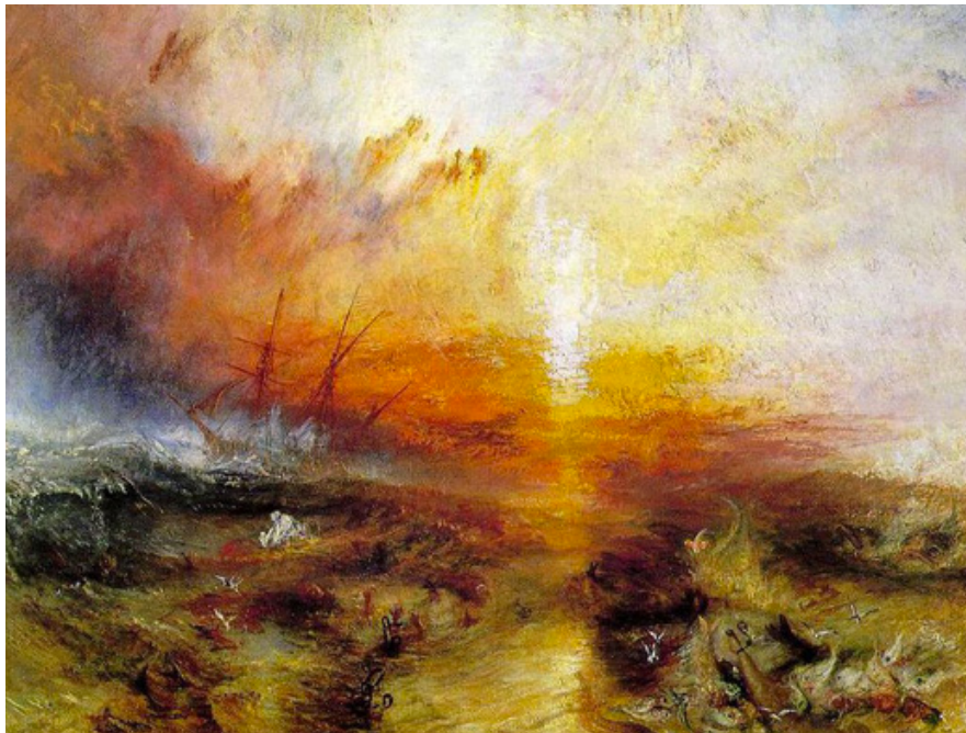
J. M. W. Turner, The Slave Ship , 1840.

slavery, linear perspective – the central viewpoint, the position of mastery, control, and subjecthood – is abandoned and starts tumbling and tilting, taking with it the idea of space and time as systematic constructions. The idea of a calculable and predictable future shows a murderous side through an insurance that prevents economic loss by inspiring cold-blooded murder. Space dissolves into mayhem on the unstable and treacherous surface of an unpredictable sea.