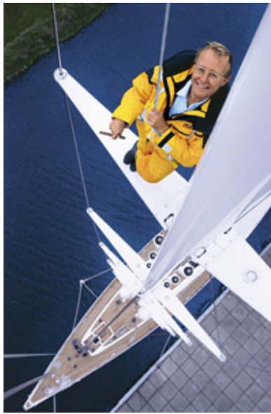
Netscape's Jim Clark stands atop 192ft mast of his "superyacht," Hyperion, during a 1998 Fortune shoot.

of areas began to take hold. Cinema supplements photography with the articulation of different temporal perspectives. Montage becomes a perfect device for destabilizing the observer's perspective and breaking down linear time. Painting abandons representation to a large extent and demolishes linear perspective in cubism, collage, and different types of abstraction. Time and space are reimagined through quantum physics and the theory of relativity, while perception is reorganized by warfare, advertisement, and the conveyor belt. With the invention of aviation, opportunities for falling, nose-diving, and crashing increase. With it – and especially with the conquest of outer space – comes the development of new perspectives and techniques of orientation, found especially in an increasing number of aerial views of all kinds. While all these developments can be described as typical characteristics of modernity, the past few years has seen visual culture saturated by military and entertainment images' views from above.