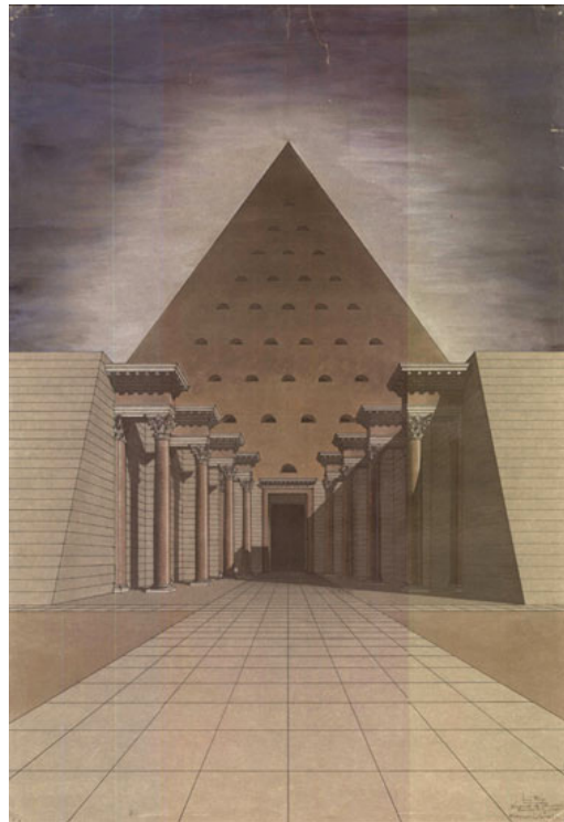
Luís Moya Blanco, Architectonic Dream , 1938. Proposal for a post-Spanish Civil War fascist monument.

This lack of funding is of course connected to the precarious political situation in which this investigation finds itself in. The unidentified skulls and bones speak about anything but their names and identities. They show perimortem trauma and indicators of stature, gender, age, and nutrition, but this doesn't necessarily lead to identification. 9 More than anything, the unidentified remain generic, faceless, all mixed up with combs, bullets, watches, other people, animals, or the soles of shoes. Their indeterminacy is part of their silence, and their silence determines their indeterminacy. They maintain an obstinate opaque silence in the face of sympathetic scientists and waiting relatives. As if they chose not to answer to their last final interrogators either. Shoot me all over again, they seem to say. I'm not telling.