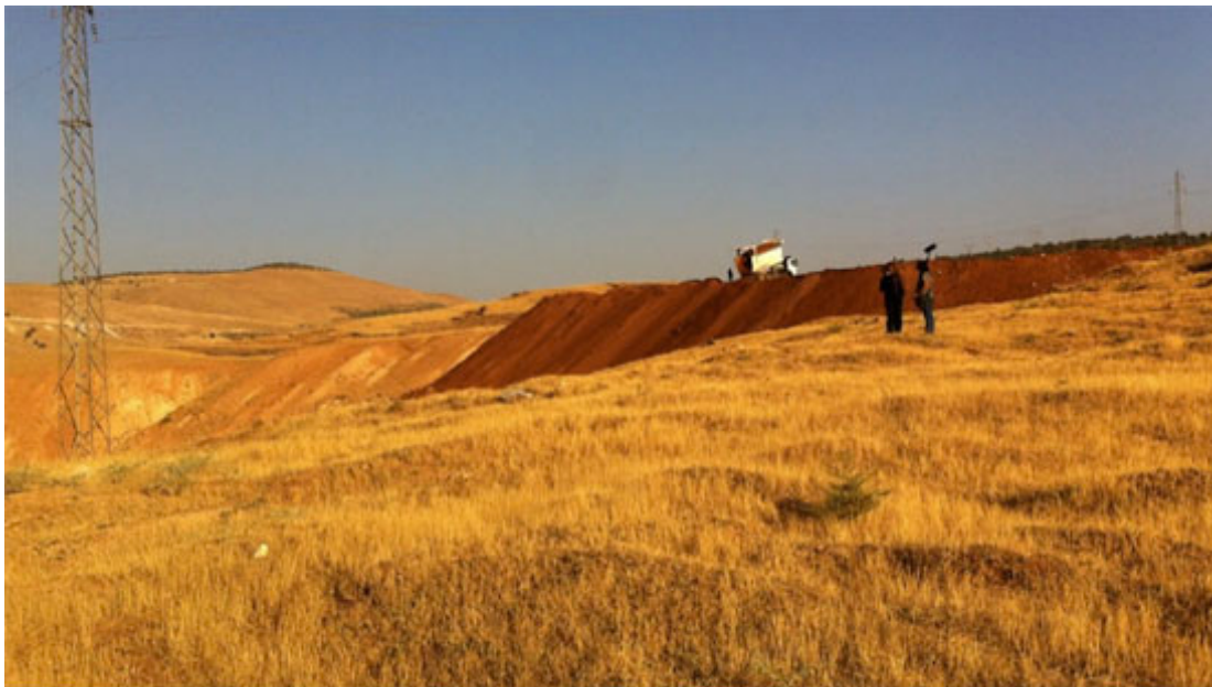
Trash being dumped into site of suspected mass grave at Kasapderesi Siirt Province Turkey, Oct. 2011.

explosives, which Albert Einstein eagerly added to the quantum list of WMDs. 4