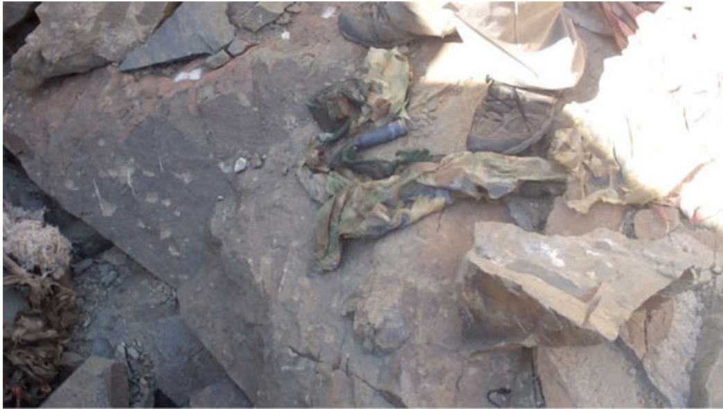
Burnt photo roll in situ between guerilla uniform rags belt buckle and 20mm ammunition case. A shoulder blade is stuck between rocks close by.