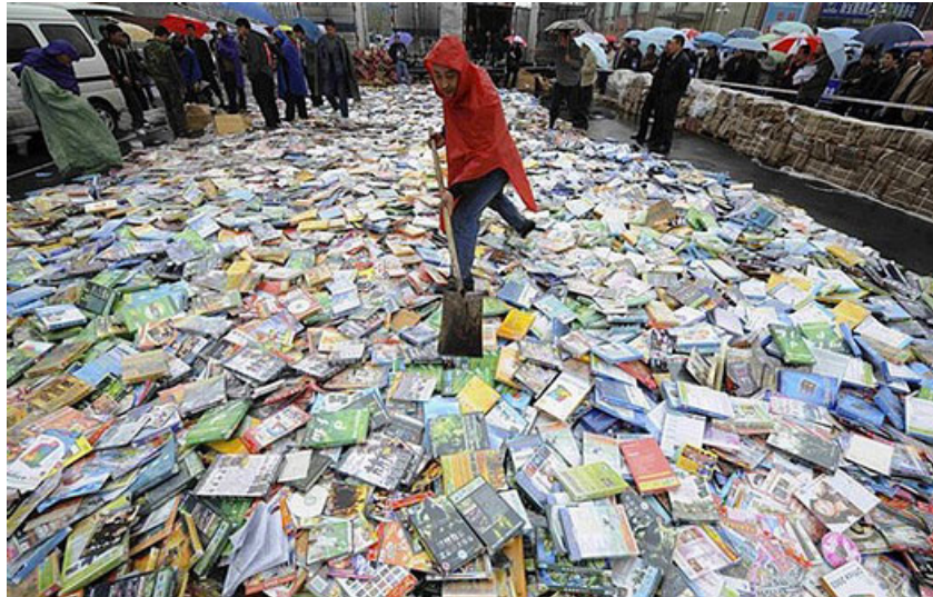
Shoveling pirated DVDs in Taiyuan, Shanxi province, China, April 20, 2008.

look at any electronics store and this system, described by Harun Farocki in a notable 2007 interview, becomes immediately apparent. 2 In the class society of images, cinema takes on the role of a flagship store. In flagship stores high-end products are marketed in an upscale environment. More affordable derivatives of the same images circulate as DVDs, on broadcast television or online, as poor images.