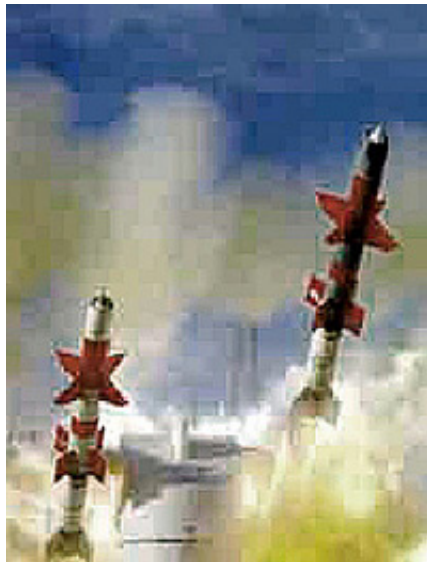
Thomas Ruff, jpeg r1104 , 2007.

or grassroots distribution circuits – reveal erratic and coincidental links between producers everywhere, which simultaneously constitute dispersed audiences.