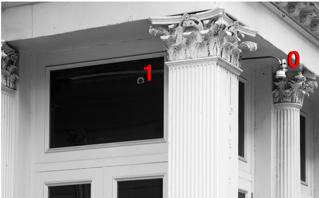
[A topographic satellite map view and a street view of the Cortlandt Alley and White Street intersection (where Artists Space is located) shows both the roof and the ground floor façade placements of ∞, 2024, a pinhole camera that images the Sun's position in the sky via long exposure over the duration of the exhibition, fwiv . The placements are indicated by the number "0" corresponding to the exhibition map and checklist. The White Street placement is atop the building's security camera. On the Cortlandt Alley façade, the number "1" indicates the exterior view of Days (Cortlandt Alley Crosswalk) , 2024 and shows an open lens mounted to a blacked out upper window.]