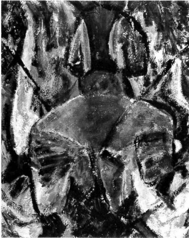
MARGRIT LEWCZUK For Freda 1985 oil on linen 20 x 16"