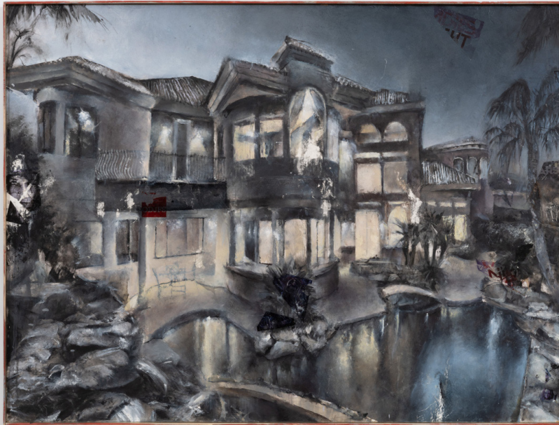
Catherine Mulligan, Las Vegas Mansion , 2023.

it's also formally tight. I see similarity with our approach to the figure that's vernacular. They are two sides of this nightlife coin—one is a really fun and glamorous euphoric space and one is the comedown.