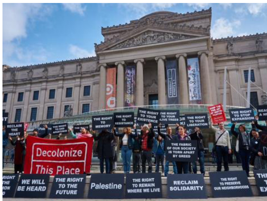
“Decolonize This Place” protest outside the Brooklyn Museum, May 7, 2016.