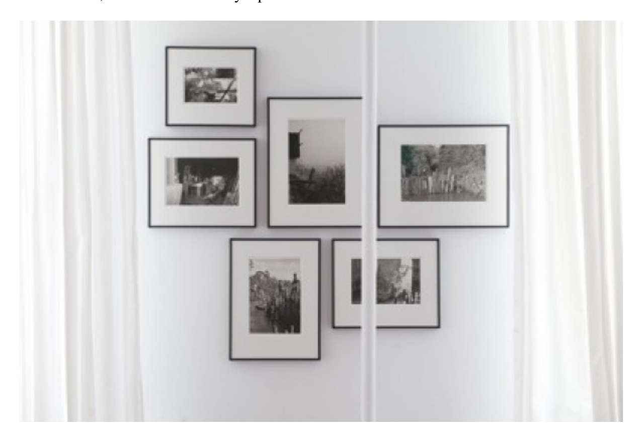
Danh Vo, Autoerotic Asphyxiation, 2010.

In recent years, Vo's practice has emphasized appropriated items that question ideas of ownership and identity. Works have included the marker of his grandmother's temporary grave – her name written in the Latin alphabet – as well as legal marriage documents lengthening his own name and three items coveted by his father in Vietnam but only attained in the West: a Rolex, a Dupont lighter and an American military class ring. Though these objects cite a personal history, they become detached as they interact with audiences and with one another, creating a kind of updated dialogue. Vo presents dismantled fragments of his own past to remind us that memory is a vestigial collection, perpetually reassembled, of which we are only a product or effect.